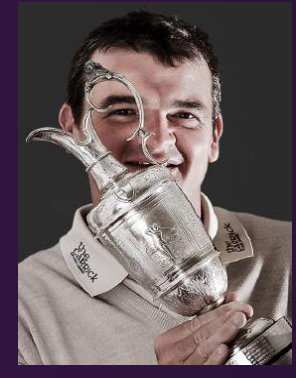
Paul Lawrie (SCO) 1 Major Victory 2 Ryder Cups