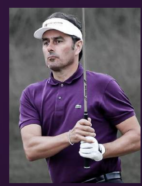
Jean van de Velde (FRA) First French Ryder Cup Player, 12 World Cup cops