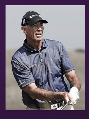
Tom Lehman (USA) 1 Major Victory 2006 Ryder Cub Captain