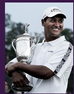
Michael Campbell (NZ) 7 Furopean Tour Wins