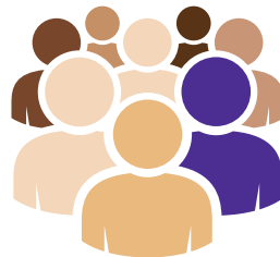
Affects an estimated 500,000 people worldwide