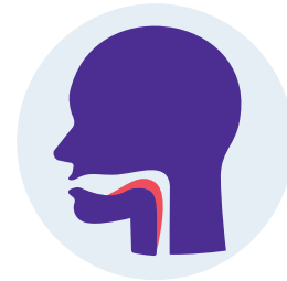
Can affect internal organs