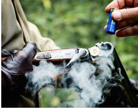
Join a shooting team and smash clays