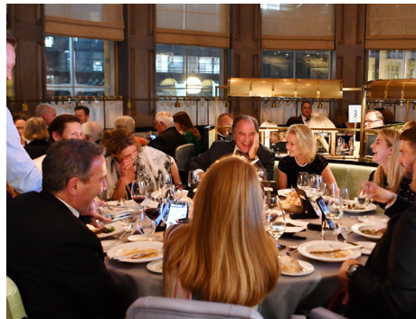
Enjoy an evening at our gala events