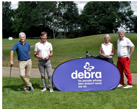
Join the DEBRA Golf Society