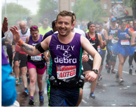
Take on a personal challenge